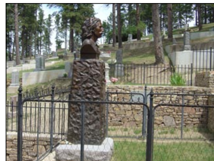
Wild Bill's grave in foreground, Calamity Jane's grave in background

Deadwood's most famous citizen was Wild Bill Hickok who was murdered at the age of 39. He was shot in the back while he was playing poker with friends at the original Saloon No. 10. He was holding black aces and black eights, now called the "Dead Man's Hand". He is buried in the local Mt. Moriah Cemetery. Calamity Jane is buried beside him.