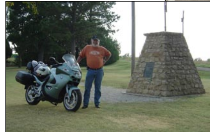
Geographical center of lower 48 states, near Lebanon, KS

Rock, Nebraska and the geographic center of the lower 48 states.