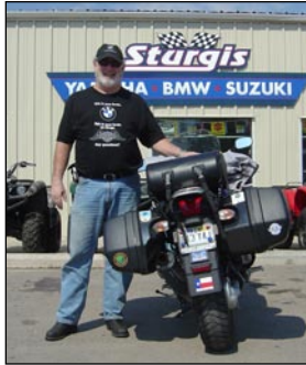
HCBMWR member in front of Sturgis BMW dealership

The 2nd Annual Sturgis BMW Black Hills Stampede was held July 8-10, 2005 in Spearfish, SD. Spearfish, population approximately 11,000, is located along I-90, 20 miles west of Sturgis, SD, home of the Black Hills Motorcycle Rally, simply called Sturgis.