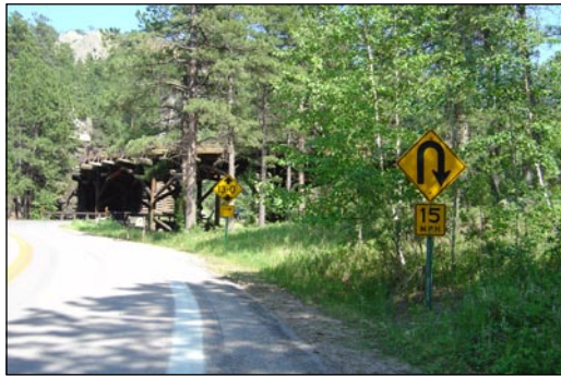
A pigtail bridge on Hwy 16A

For riders who love crooked roads, Hwy 16A is a must. It intersects Hwy 244 near Mt. Rushmore and ends at Hwy 36 after passing through Custer State Park, home to buffalo herds. There are pig tail bridges, short tunnels carved in the hills, lots of pine trees, and once and a while spectacular views of Mt. Rushmore.