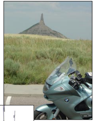
Chimney Rock, NE

I started back from Spearfish, Monday, July 11. My route took me to two other little know landmarks, Chimney